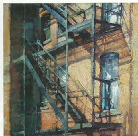
Jill Soukup (b. 1969) Orange Parceled 2010, Oil on board, 16 1/2 x 17 in. Private collection