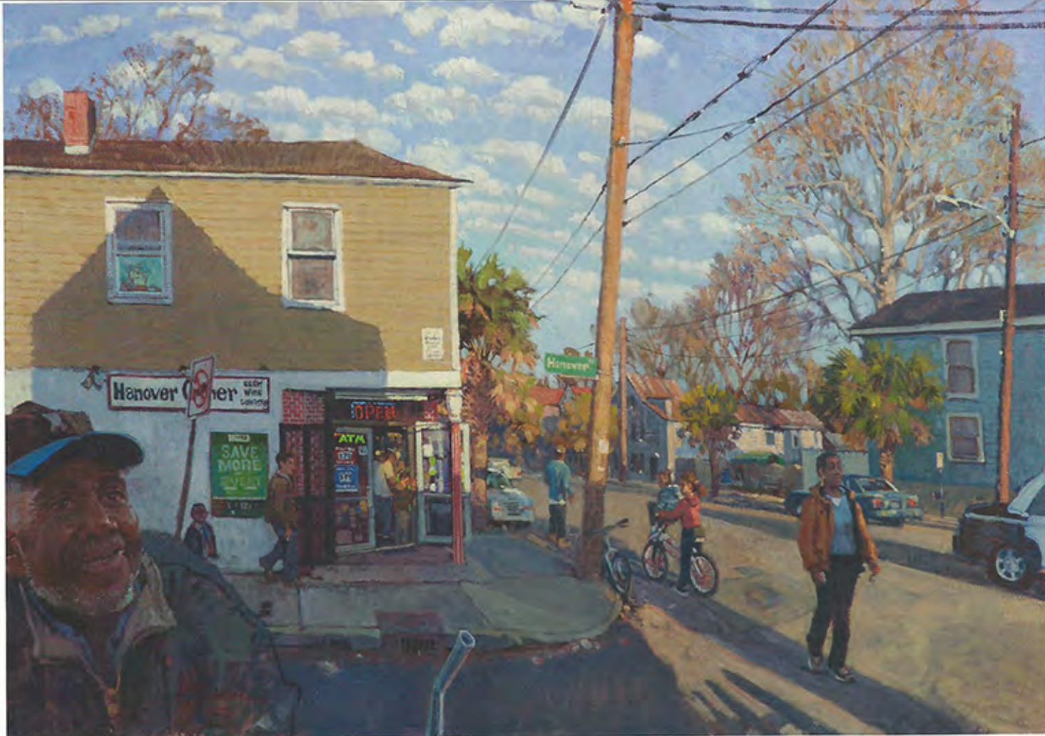
West Fraser (b. 1955) Talkin' about Spring 2013, Oil on linen, 30 x 40 in. Helena Fox Fine Art, Charleston