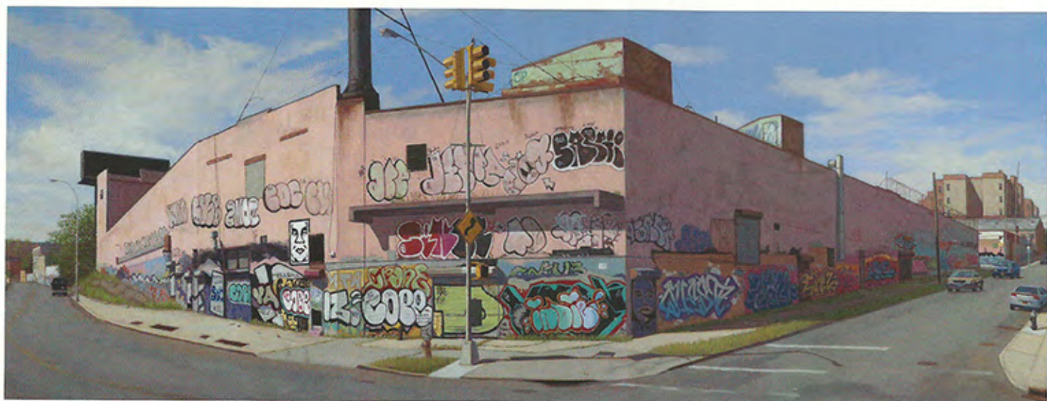
(Below) Valeri Larko (b. 1960) Loading Dock, Bronx 2012, Oil on linen, 32 x 58 in. On view at J. Cacciola Gallery (New York City), May 30-June 29